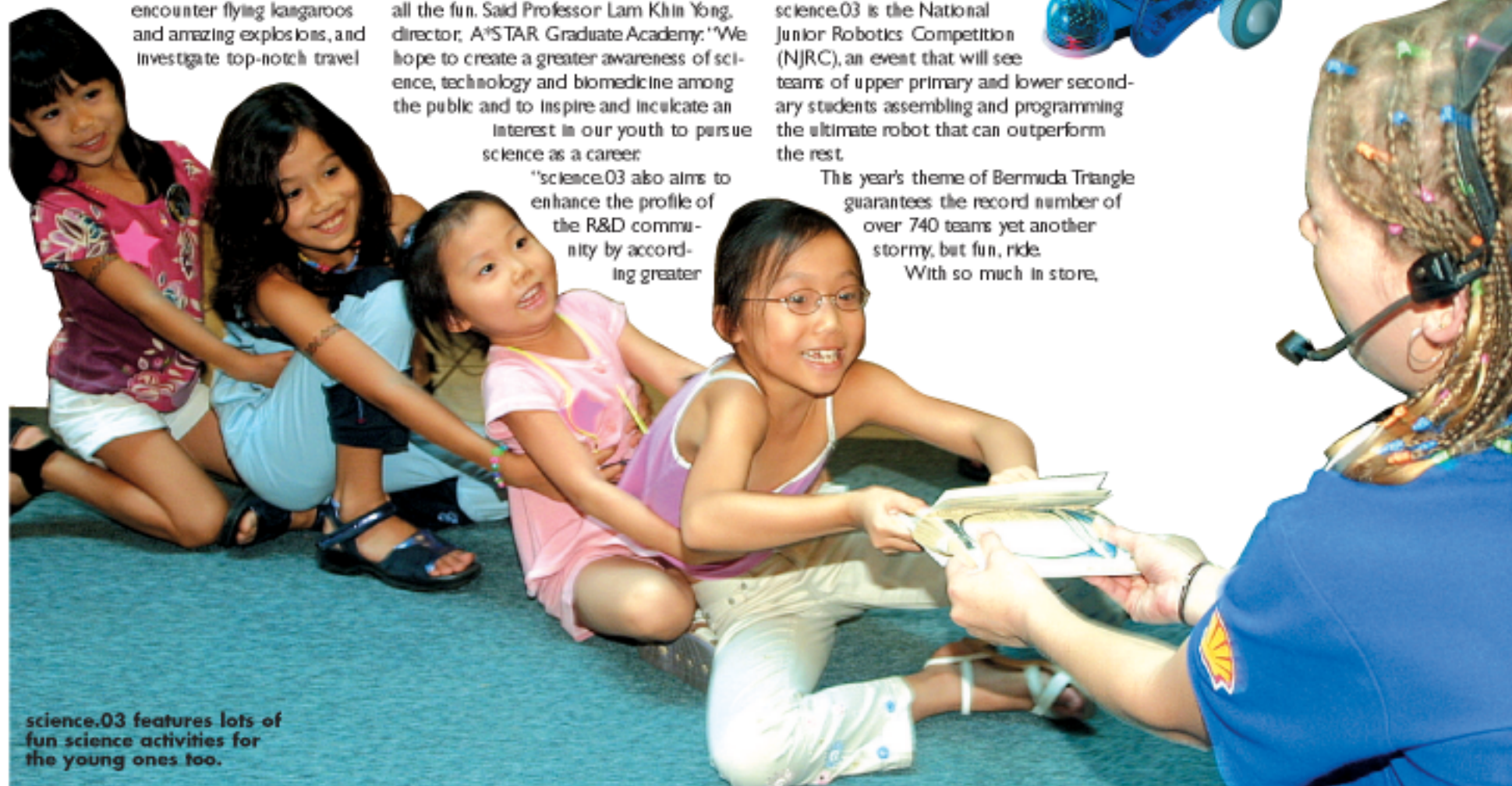
science.03 features lots of fun science activities for the young ones too.