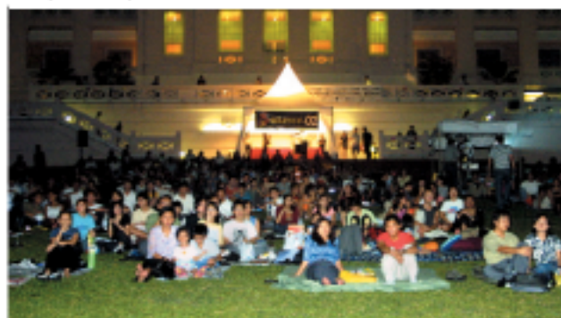
The Sci-Fi screenings will offer X-Men 2 , Minority Report and Terminator 1 and 2 .

there's bound to be something for everyone. So, don't miss the fun and excitement in science.03.