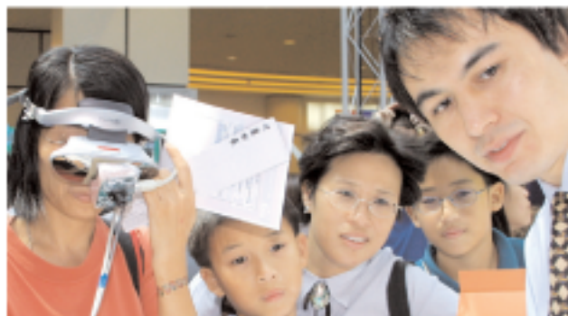
Science is fun for grown-ups too, as this visitor finds out in last year's X-periment!.

This year's theme of Bermuda Triangle guarantees the record number of over 740 teams yet another stormy, but fun, ride. With so much in store,